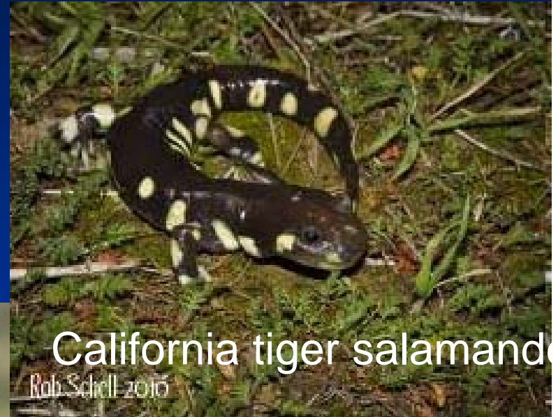
California tiger salamander