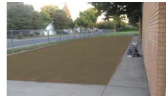
After step one...