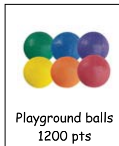
Playground balls 1200 pts

← Clip Labels and bring into school for POINTS towards Athletic & Art Supplies